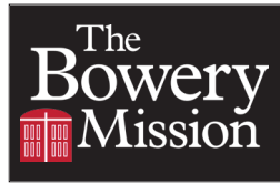
2. Primary Inverted