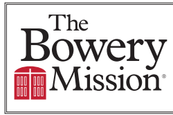
1. Primary (preferred)