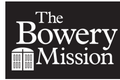
4. Primary B&W Inverted