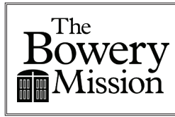
3. Primary B&W