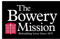
2. Primary Inverted