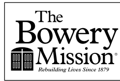
3. Primary B&W