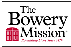
1. Primary (preferred)